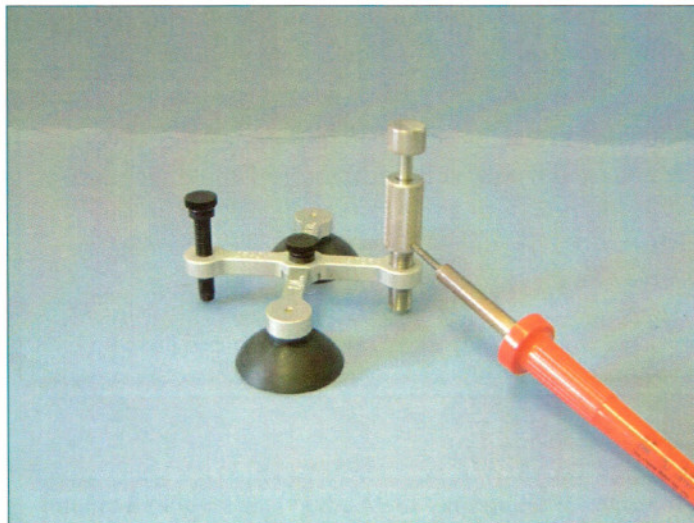
Steel Injector With Heater